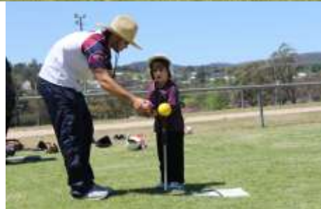
Granite Belt Have A Go Day - October 2012