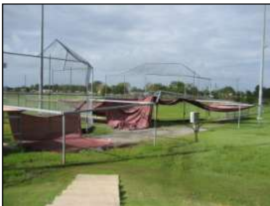
Floods once again leave a trail of destruction at the Mackay Softball Association grounds.